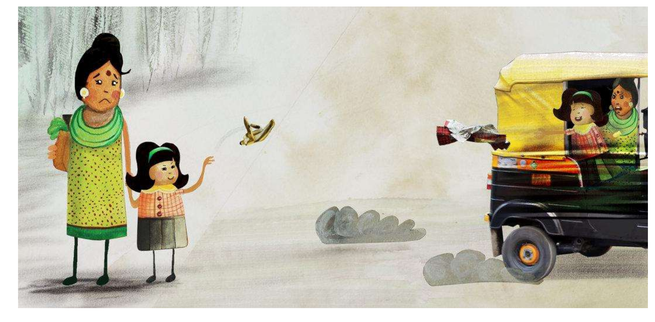
"Don't throw the banana peel on the road!"

"Throw the empty biscuit packet in the dustbin."